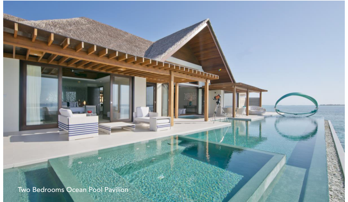
Two Bedrooms Ocean Pool Pavilion

A stretch of beach to call your own, a pool and Jacuzzi that runs alongside it, and indoor - outdoor living and dining.