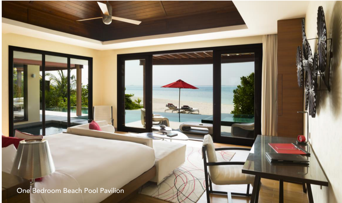
One Bedroom Beach Pool Pavilion